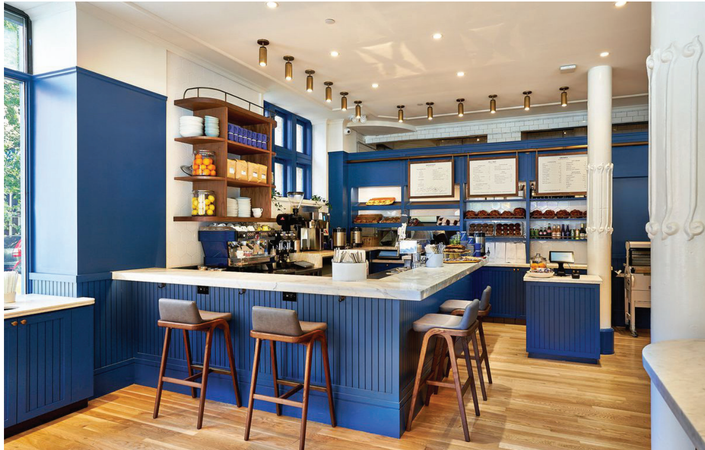
ARTS & POWERHOUSE BUILDING | JERSEY CITY, NEW JERSEY | 36,500 SF OFFICE | 59,500 SF RETAIL

Kushner and KABR Group acquired the historic 124-134 Bay Street, known as Warren at Bay, in 2016. A former warehouse built in 1914, these historic buildings are located in the Powerhouse Arts District in Jersey City, just steps from the waterfront and the Grove Street PATH Station. With over $30 million invested in renovation, the Arts & Powerhouse building will feature 20' ceilings and more than 10,000 sf of rooftop deck for tenants. This year, we brought in retailers Daily Provisions, Tacombi, and Rumble to the ground floor.