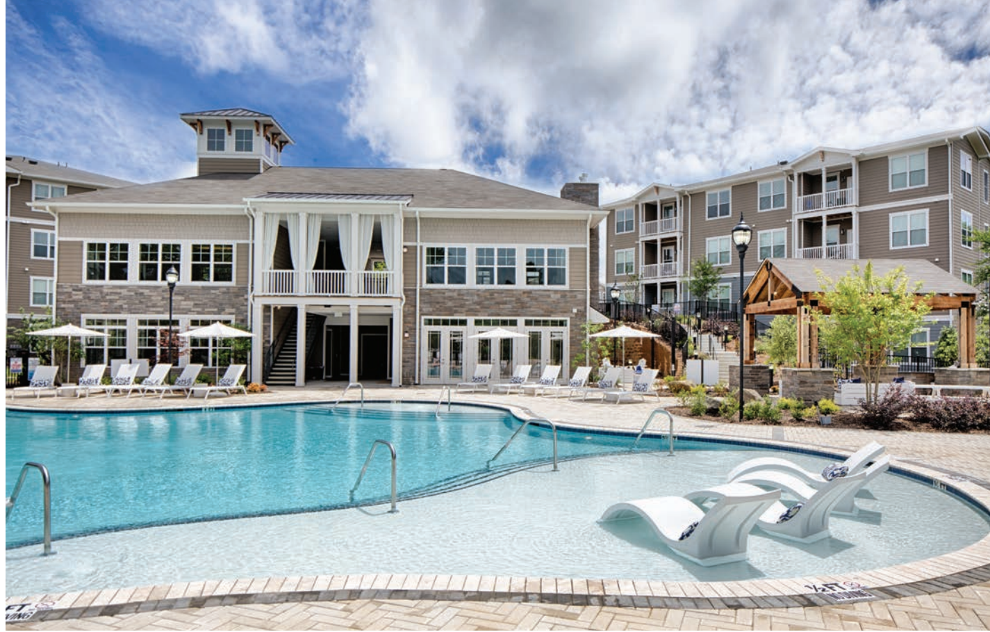
CAPITAL CREEK AT HERITAGE | RALEIGH-DURHAM, NORTH CAROLINA | 214 APARTMENTS

Purchased as part of a 2,300-unit portfolio spanning five states in the Southeastern Sunbelt, this deal was done completely off-market. Capital Creek is located in Raleigh-Durham, a center for high tech and biotech research and development, and features resort-style amenities including a saltwater pool, outdoor fireplace and lounge area, and 2,000 sf state-of-the-art fitness center.